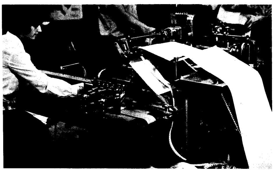
Here's the Cheshire mailing machine in action with a stack of PLAIN TRUTHS entering on the right and labeled for mailing at six per second!

With the fastest machine available, God's Work is set to LEAP ahead.